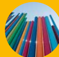
Plastic and Rubber Materials